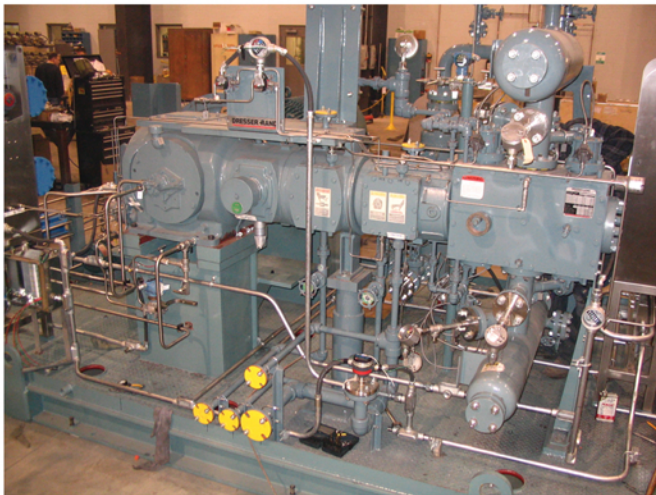
Fuel Gas Reciprocating Compressor Packages

Cobey partners with engineering and operating companies who are installing new, upgraded or expanded systems to improve efficiencies and meet new emissions and other standards. Cobey will specify, design and manufacture customized systems according to your unique needs.